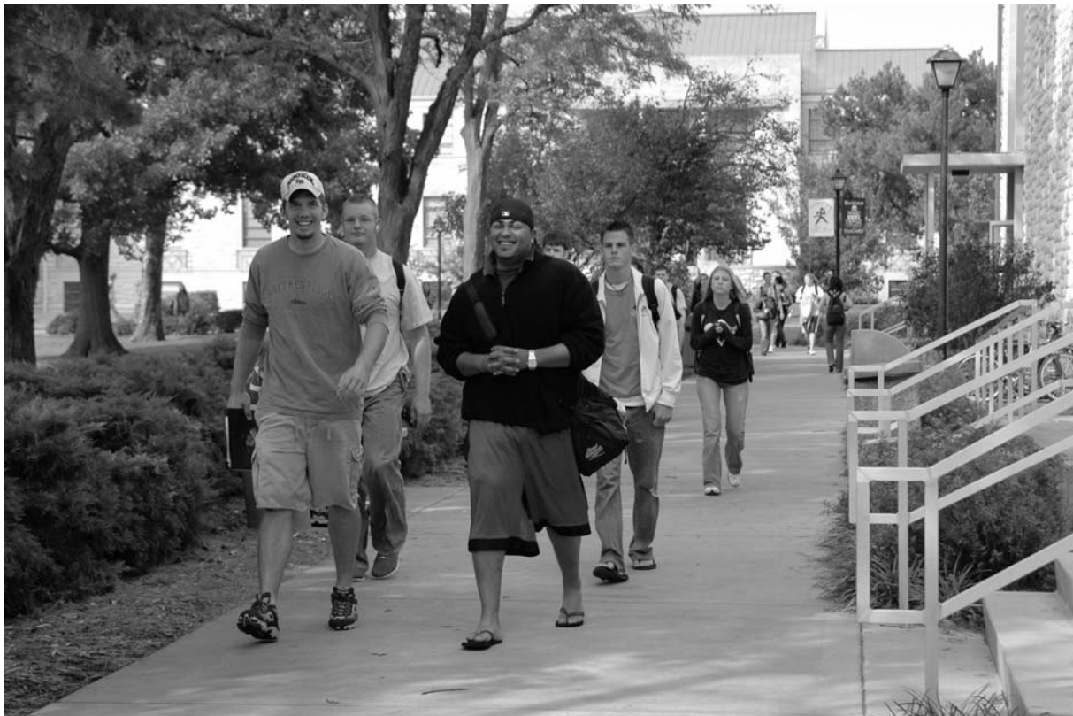
The scenic campus enhances a walk to class on a pleasant autumn day.