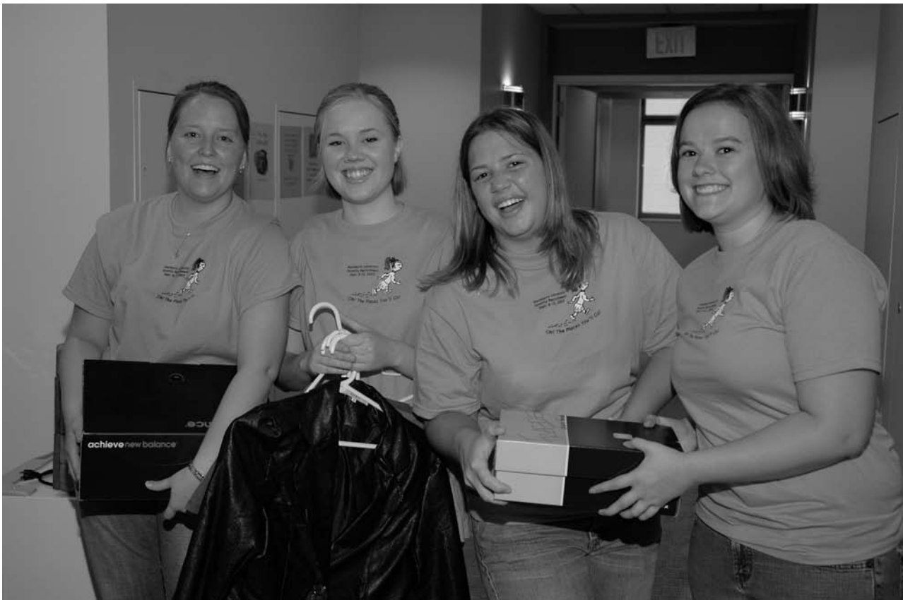
Members of Delta Gamma sorority join in the fun on Move-In Day.