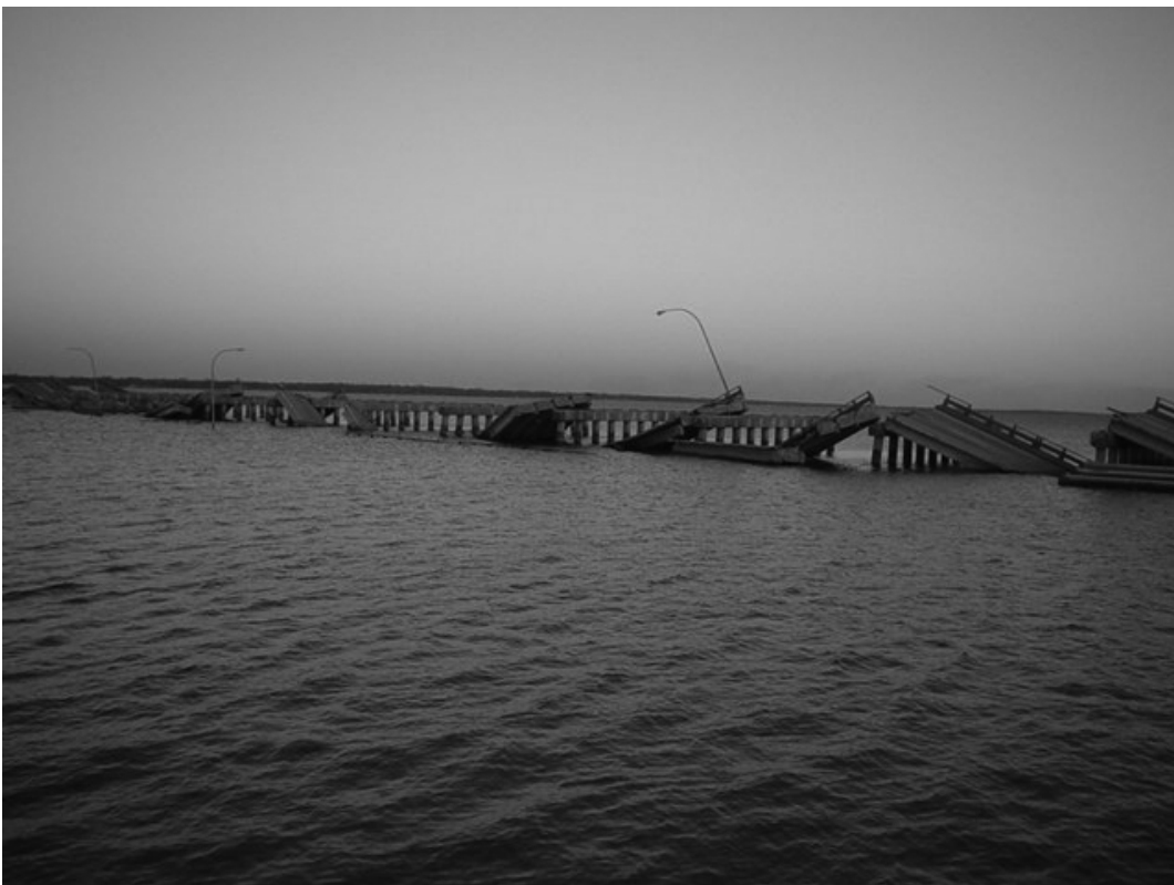
A different perspective of the bridge damage caused by Hurricane Katrina.