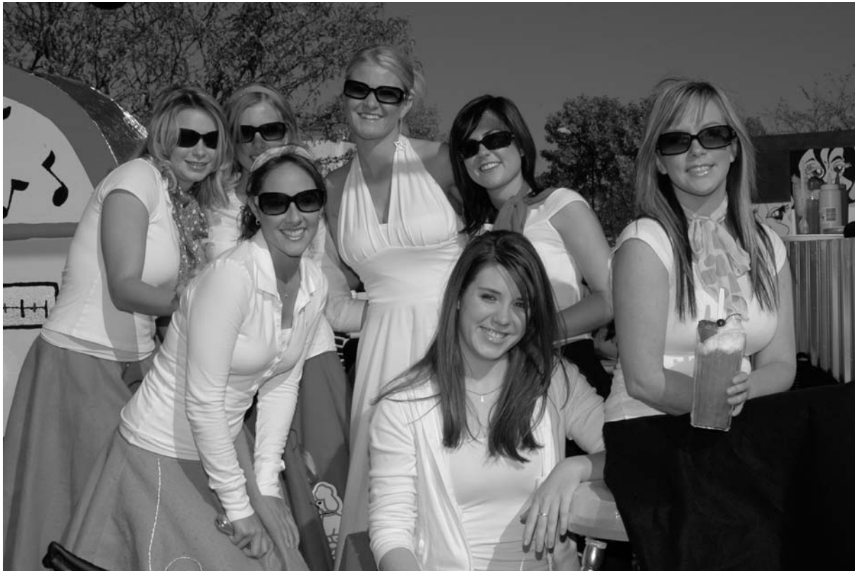
Alpha Phi sorority members embrace the fashions of the 1950s for Homecoming.