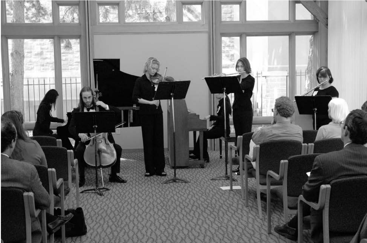
Student musicians showcase their talents during a concert in Carole Chapel, as participants in the annual Apeiron: A Forum of Student Research, Scholarship and Creativity.