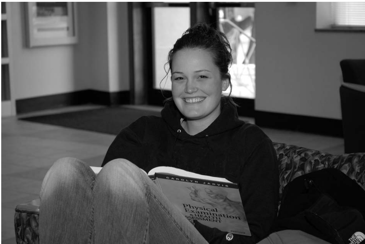
The Memorial Union is a great place to study for the next exam and mingle with friends.