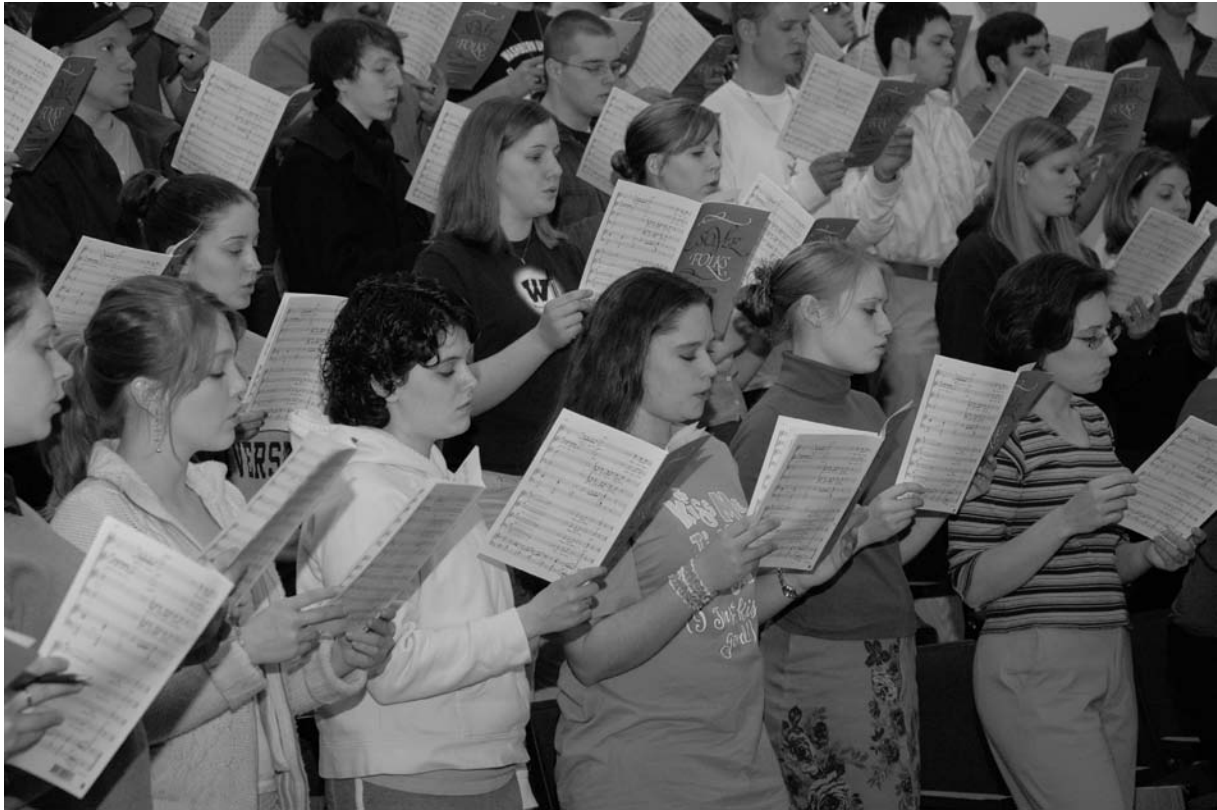
The Washburn Choir rehearses for an upcoming concert.