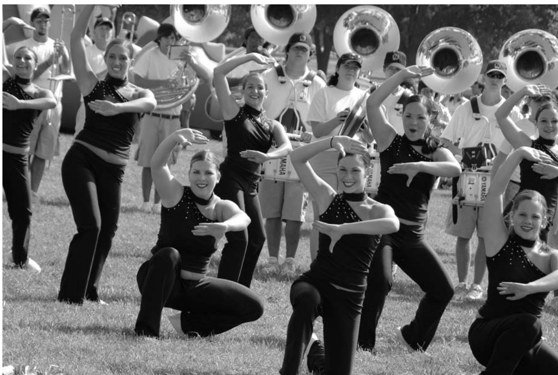
The WU Marching Blues band and the Dancing Blues meet on the field to present the halftime performance at a football game.