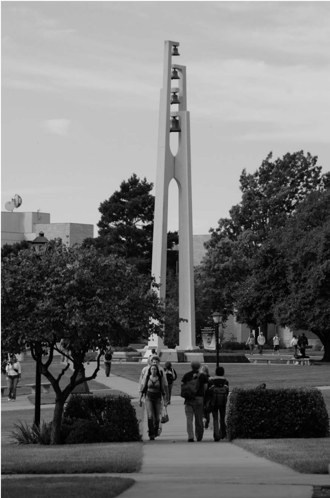
Kuehne Bell Tower contains bells from Thomas Memorial Gymnasium, which was destroyed in a 1966 tornado.