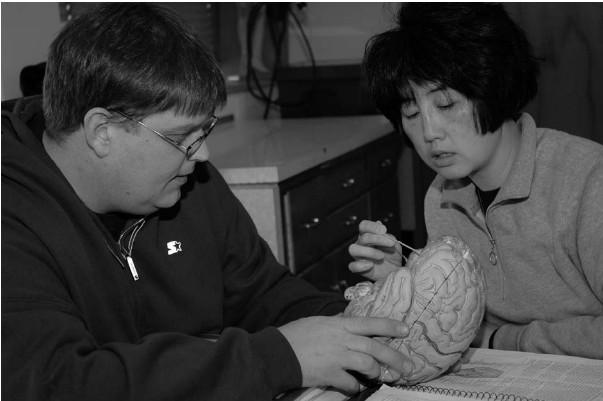
Human anatomy lab students ponder the intricacies of the brain.