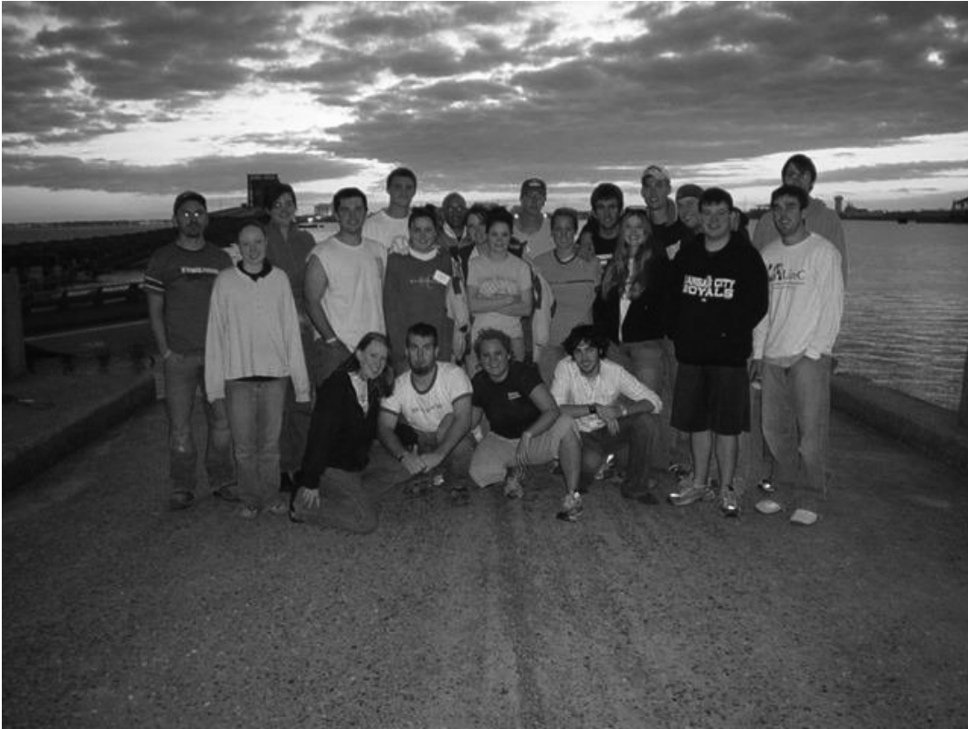
Students pose on a damaged bridge near Biloxi, Mississippi, taking a moment from their volunteer efforts to assist with clean up and renovation of areas affected by Hurricane Katrina. The January trip was coordinated by Learning in the Community.