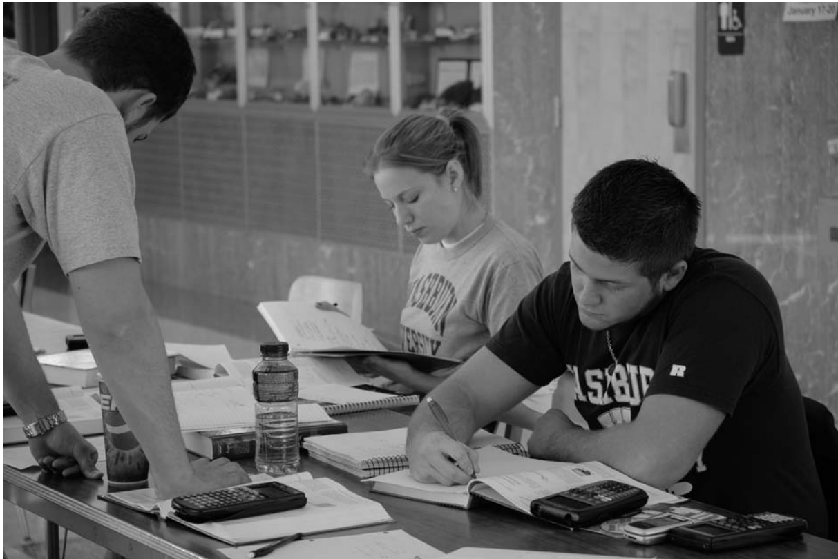
Students share thoughts and resources during the gathering of a study group.