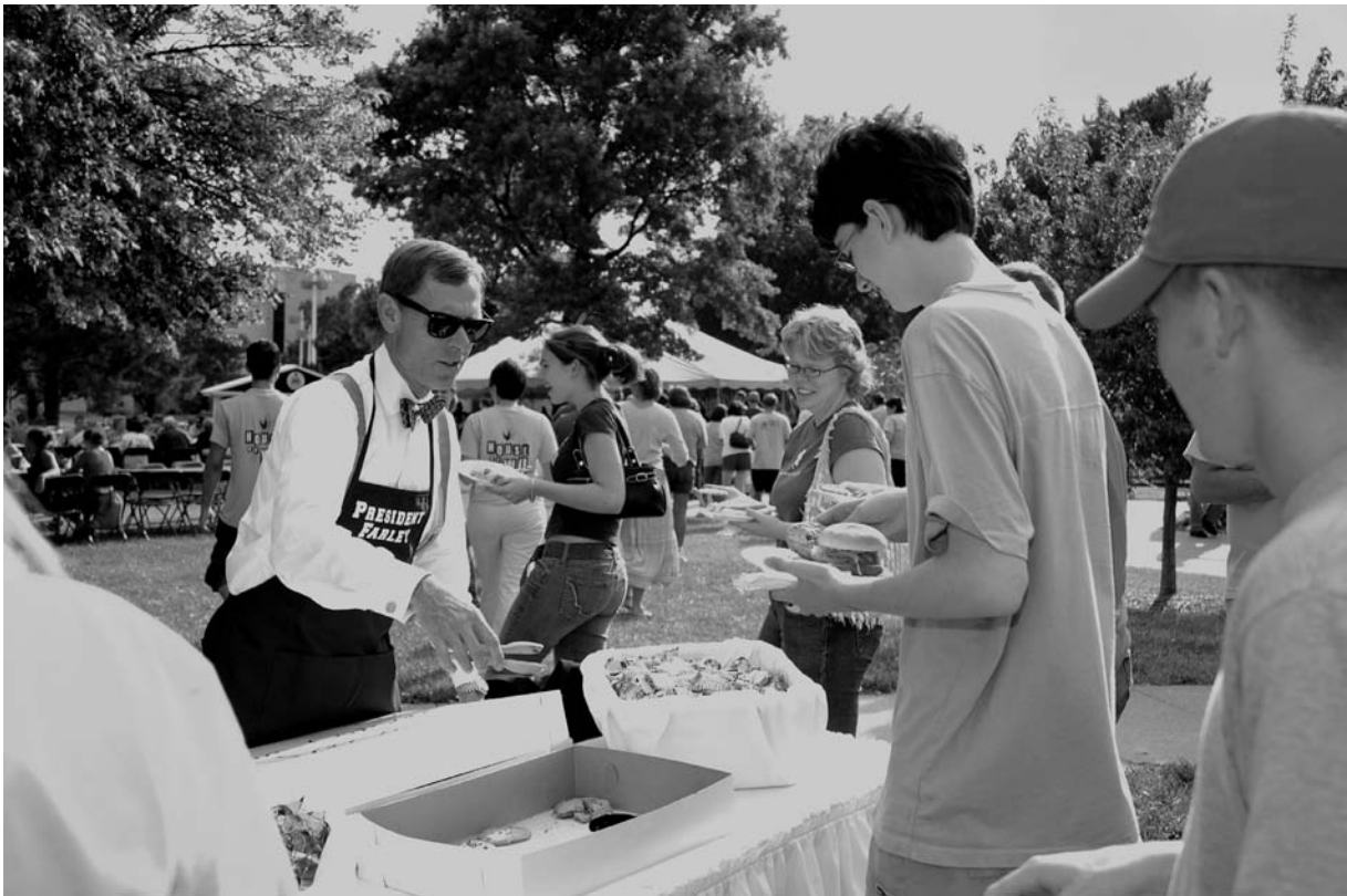
President Farley takes a shift on the serving line at the fall Family Day picnic.

Petitions are available through Academic Advising in Morgan Hall 122. For transfer students or former Washburn students who have subsequently attended another institution, an official copy of all transcripts must be on file in the Office of Admissions before the application is considered. Students must apply 30 days before each semester's enrollment period.