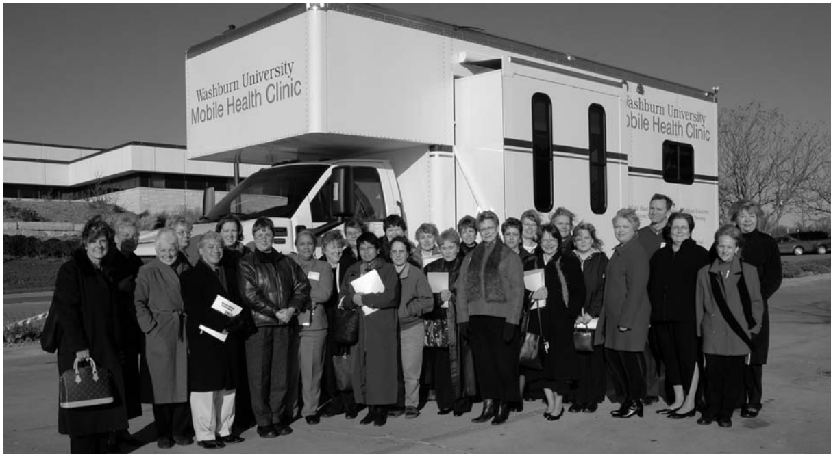
Nursing faculty and peers welcome the arrival of the School of Nursing mobile clinic, which allows students and faculty to provide care to medically underserved populations in the area.