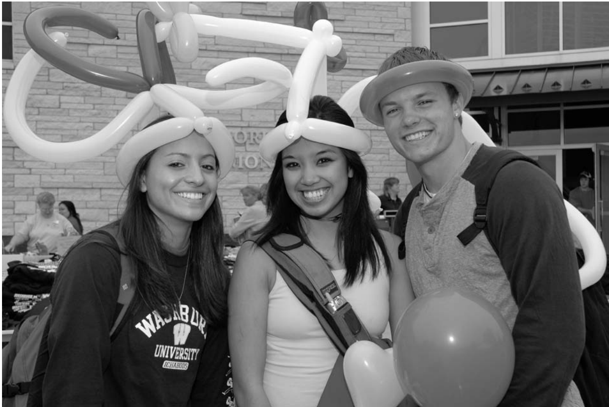
Broad smiles complement the elaborate headware sported in fun at an Octoberfest activity.