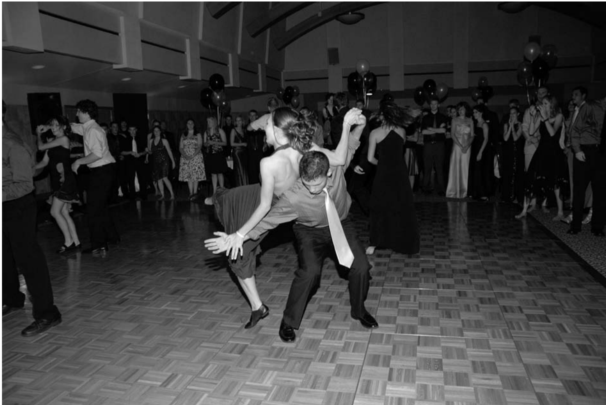
Fancy footwork abounds at a meeting of the Campus Swing Dance Club.