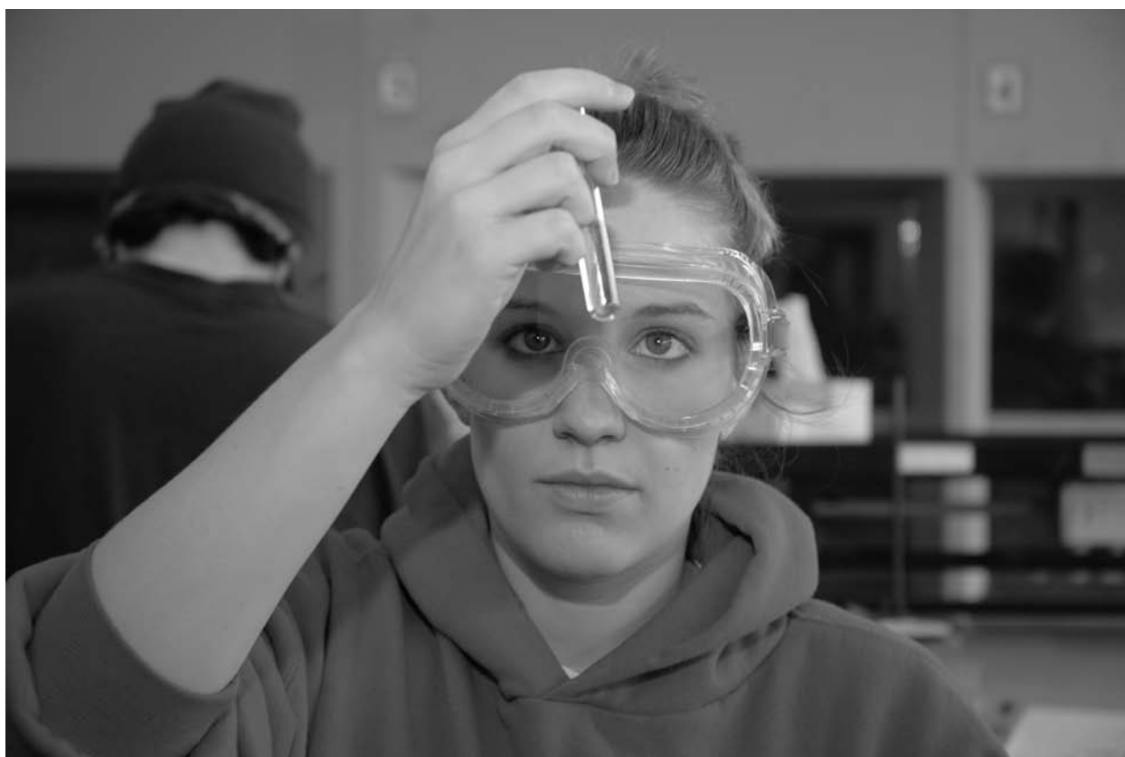
Concentration is essential when conducting an experiment in chemistry lab.