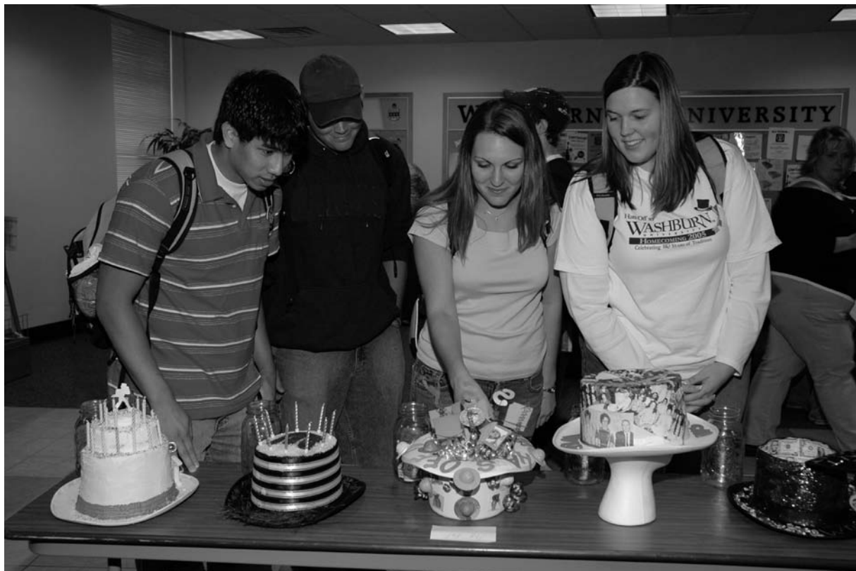
Many interpretations of creativity are exhibited in the entries donated to the "Hats Off to WU" top hat decorating contest, a Homecoming activity.

The theoretical basis of nursing practice and the understanding of self as an adult learner and as a participant in redefinition of professional identity. Emphasis is on contemporary nursing roles, current concepts of health, illness, family, the changing health care system, legal aspects, cultural basis of nursing intervention, stress management, crisis theory including grief and loss. Prerequisite: Registered Nurse student or consent.