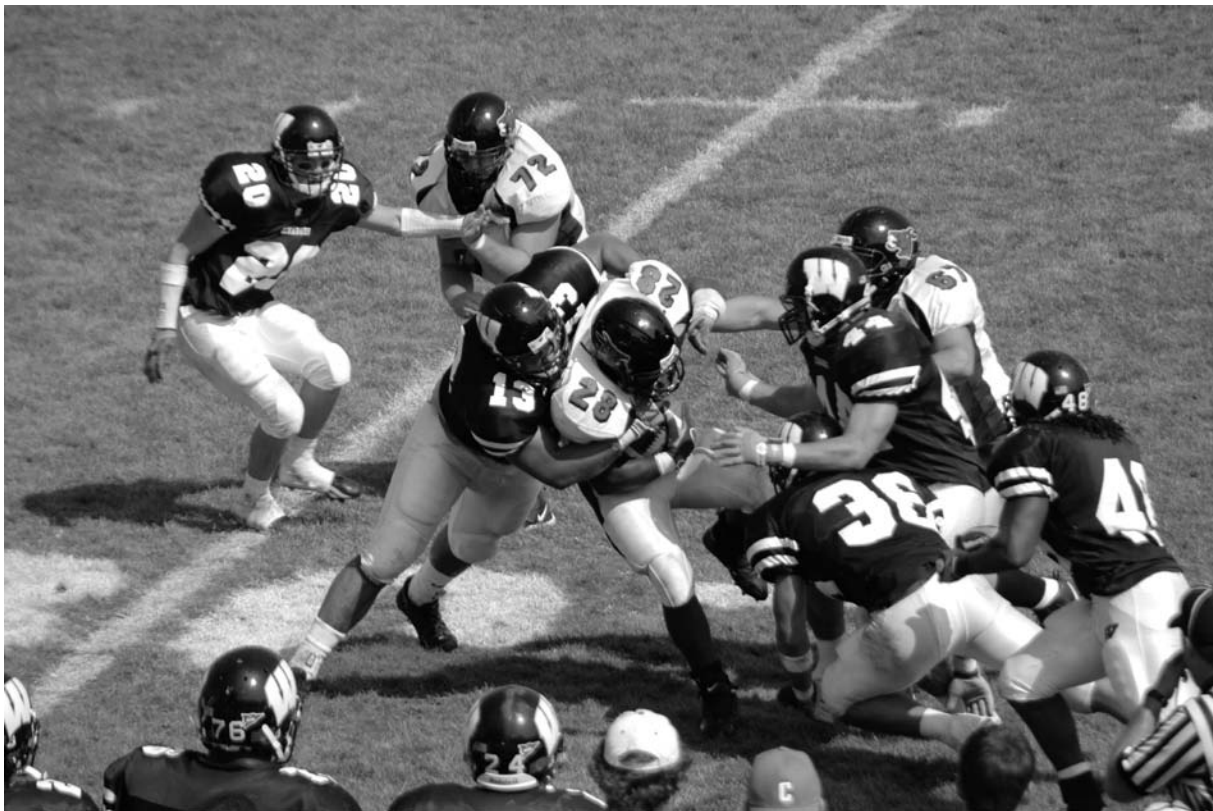
The Washburn football squad capture the 2005 MIAA conference title, the first such honor attained by the Ichabods since the 1983 team won the CSIC championship.