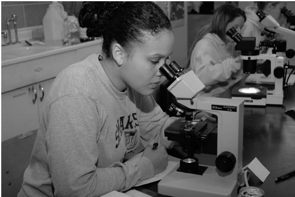
The examination of slides is a popular activity in botany classes.