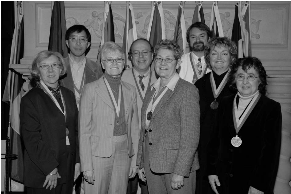
The Washburn University 2005 inductees into Phi Beta Delta Honor Society for International Scholars.