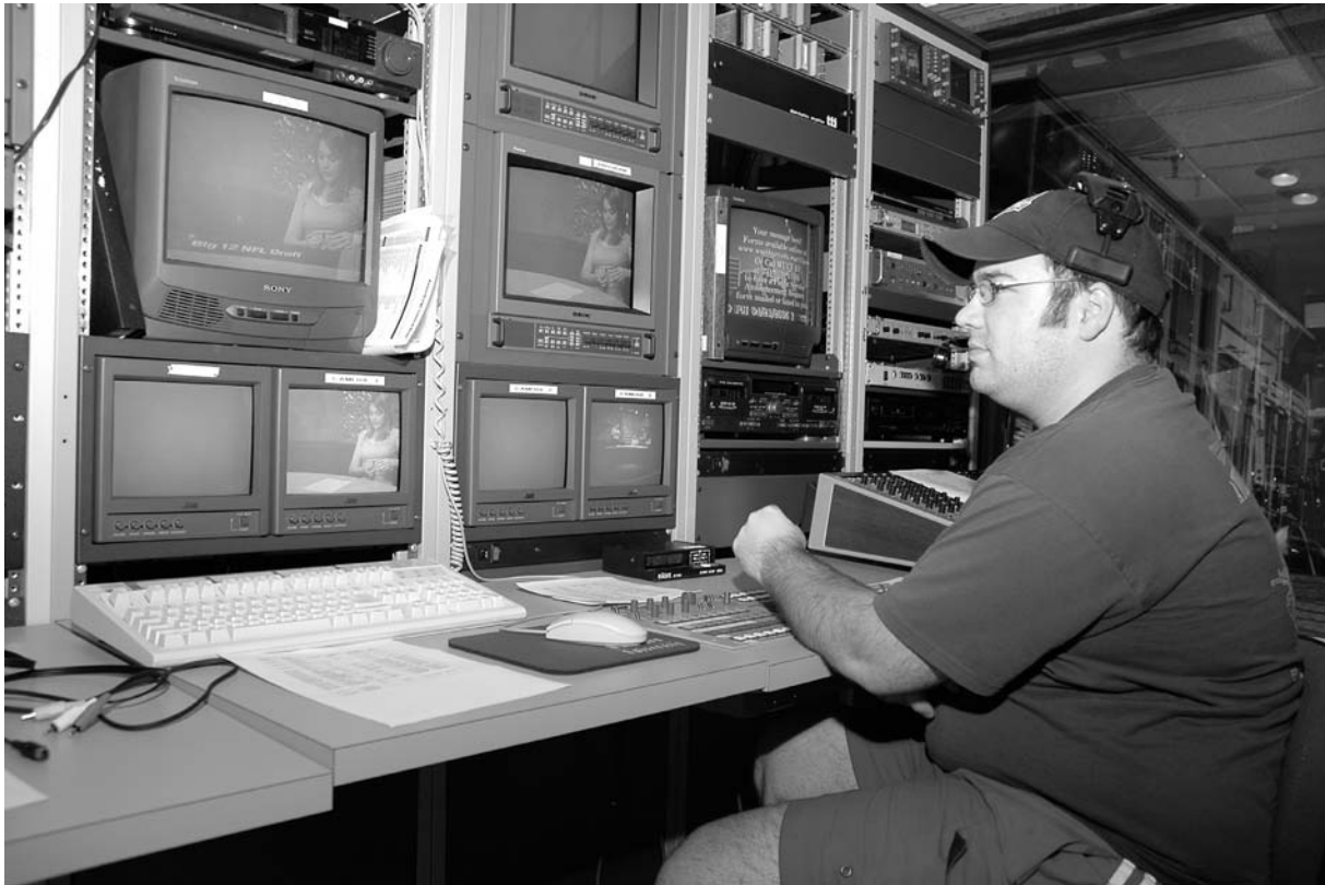
Numerous details require attention in the production of the student-run television program, "Washburn Edition."