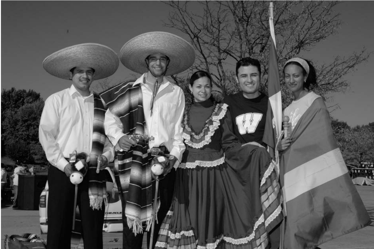
Members of Hispanic American Leadership Organization pose with international students prior to the Homecoming parade.