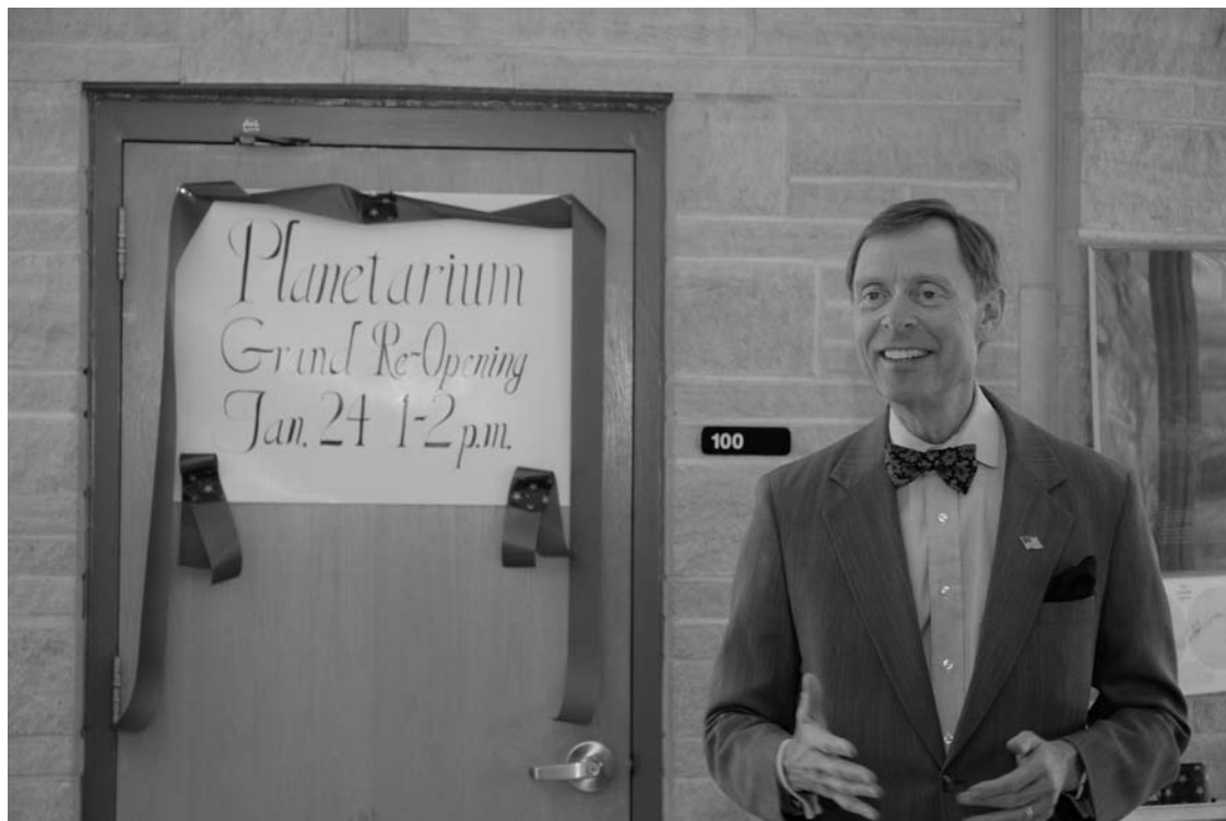
President Farley celebrates the grand reopening of the planetarium in Stoffer Science Hall.

Washburn Village Apartment-style housing for students beyond the Freshman year. Open Fall of 2004, this new 192-bed facility, located south of KTWU, includes 2-, 3-, and 4-bedroom units. Many of the bedrooms are designed for single occupancy and include a computer data port and connections for cable and telephone service. In addition to the data/cable-ready bedrooms, each unit has a bathroom with a shower/tub combination, a living room, and a small kitchenette. Fully furnished, each unit contains the same amenities often found in off-campus apartments. A commons area includes a conference room for study, a lounge area with a large-screen TV, a reception desk, mailboxes, card access to laundry facilities 24 hours a day, and the Complex Coordinator's Office.