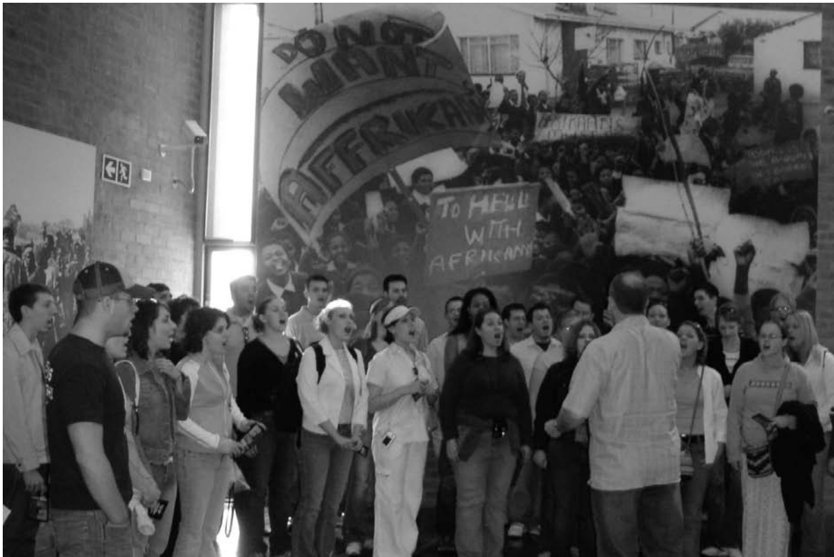
The Washburn Choir performs at the Sowetto Monument on a summer trip to South Africa.