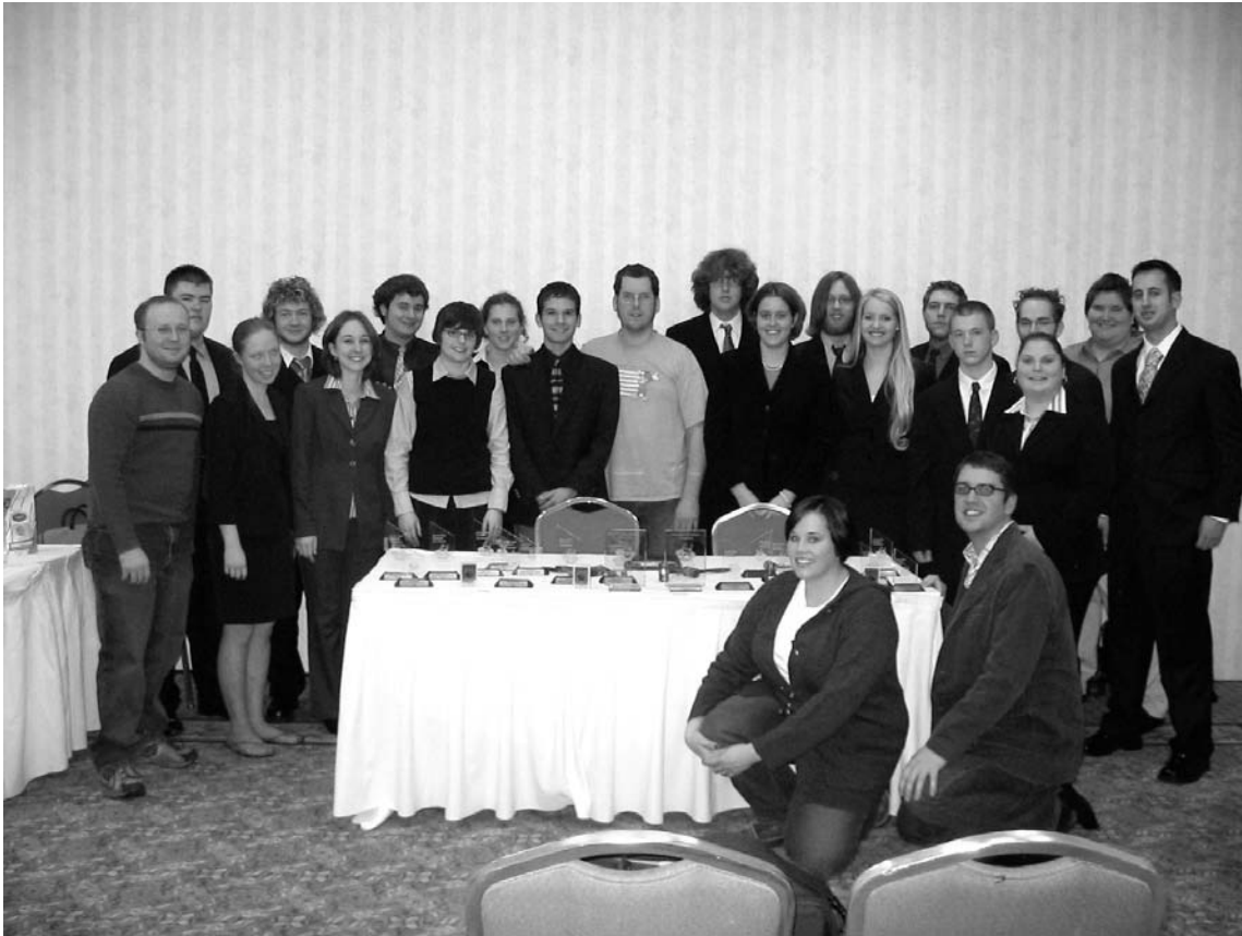
A table of trophies gives bragging rights to the nationally-ranked Talkin' Ichabods Debate and Forensics team.