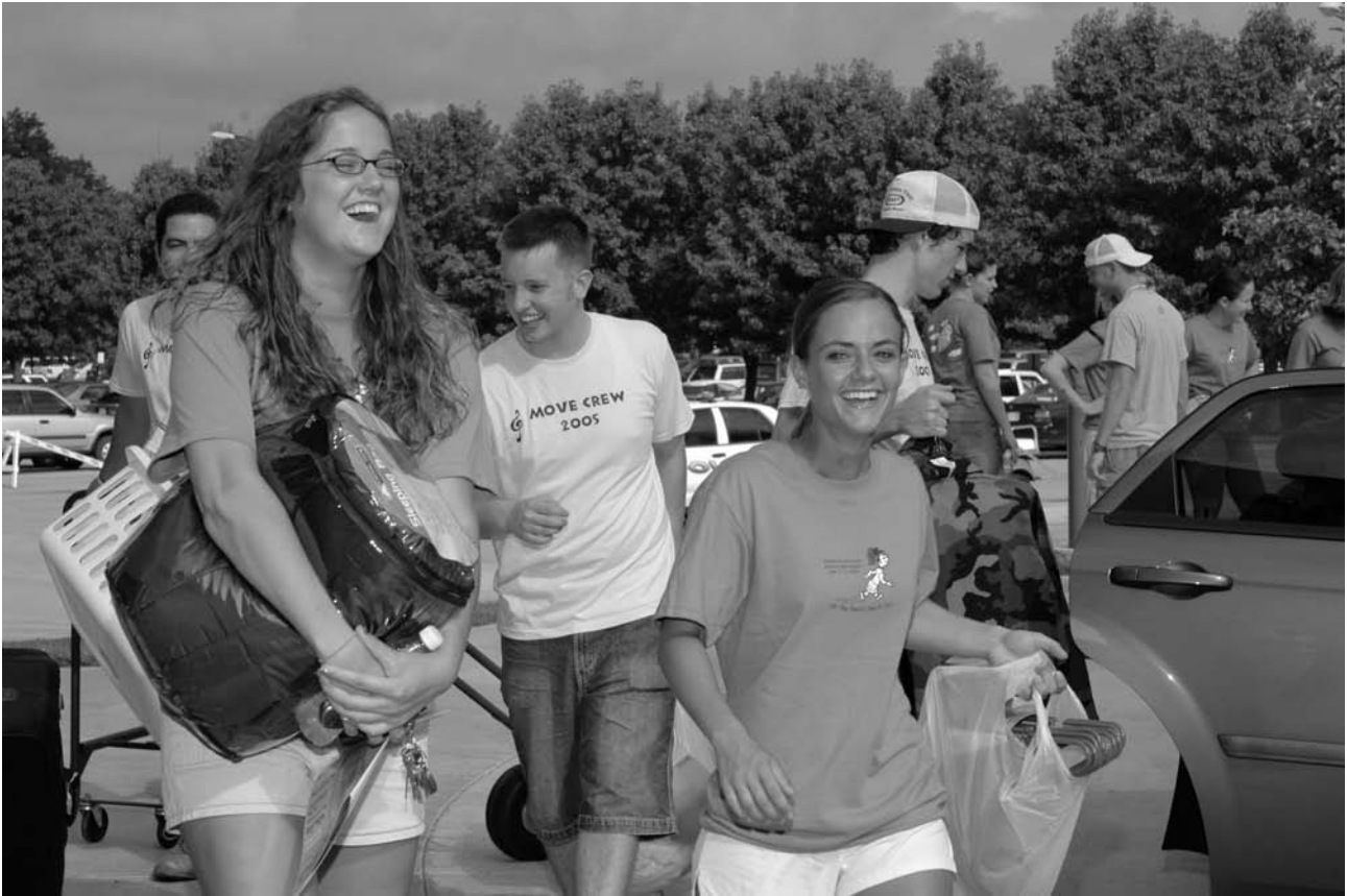
At the beginning of the fall semester, volunteers give a warm welcome and lend a hand to newcomers moving into residence halls.