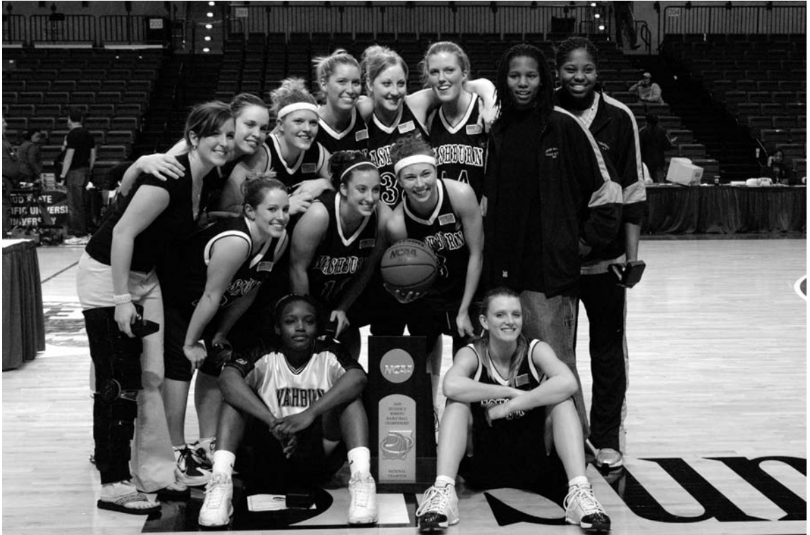
The Washburn Lady Blues reigned as NCAA Division II National Champions.