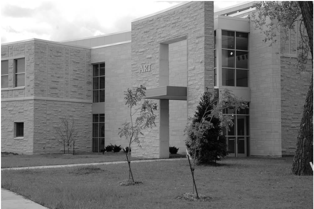
The art building opened in 2005 and features studios for faculty and staff and facilities appropriate for the teaching of drawing, design, painting, photography, ceramics, sculpture, printmaking and digital arts.