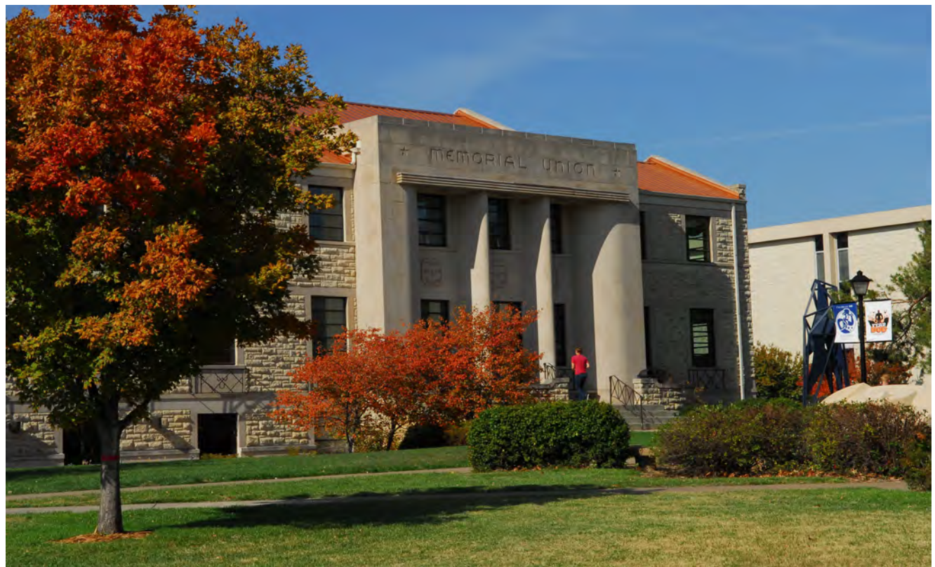
The Memorial Union, dedicated in 1952 as a memorial to Washburn students and Shawnee County residents who lost their lives in foreign wars, holds the Ichabod Service Center, Union market food court, the University Bookstore and Washburn Student Government Association.