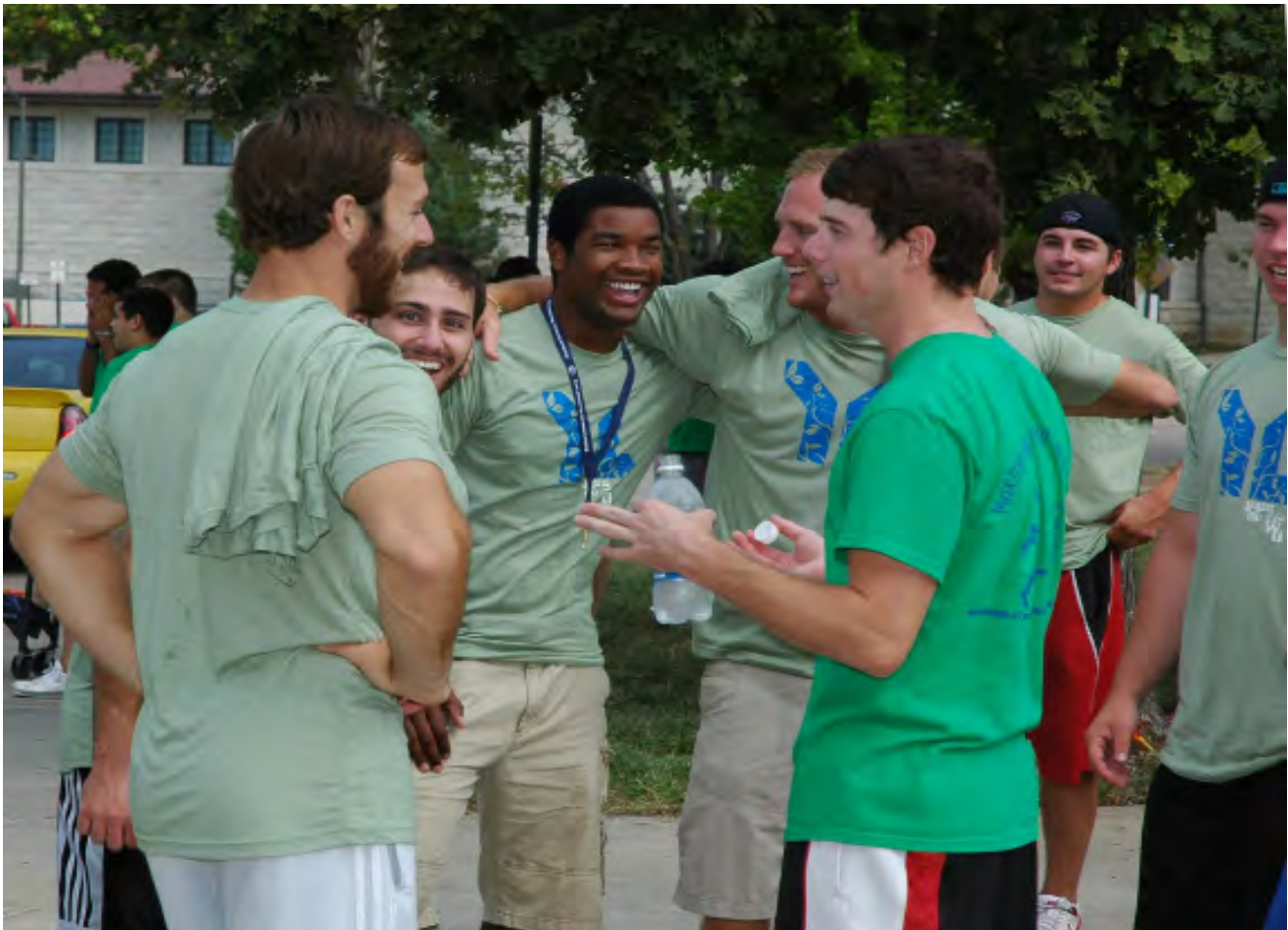
Comradery among the volunteers helping with Move-in day.

the University campus. Several apartment complexes are within easy walking distance of campus, and Topeka offers a large selection with easy access to campus. Rental costs of approximately $450/month and up should be anticipated. These costs are often shared by two to four students thus reducing the per student cost. For more information, contact the Residential Living Office, Washburn University, 1801 SW Jewell Ave., Topeka, KS 66621.