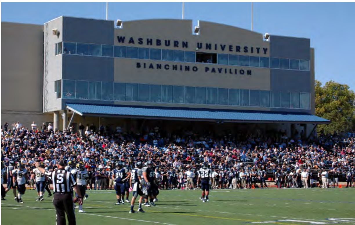
Fans enjoy cheering on the Ichabod football team.

The diverse summer program is planned for students who wish to begin their college study, for those who wish to continue their regular academic programs, for high school youth who wish to pursue special interests, and for adults who wish to pursue studies on a professional level or for individual self-improvement.