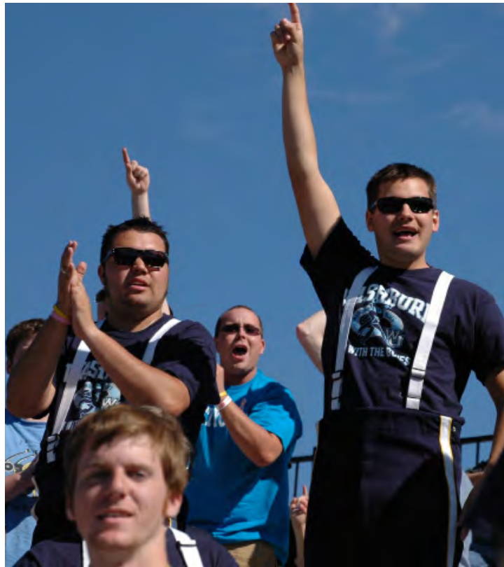
Band members display their Ichabod spirit while cheering on the football team.

Petitions are available through Academic Advising in Morgan Hall 122. For transfer students or former Washburn students who have subsequently attended another institution, an official copy of all transcripts must be on file in the Office of Admissions before the application is considered. Students must apply 30 days before each semester's enrollment period.