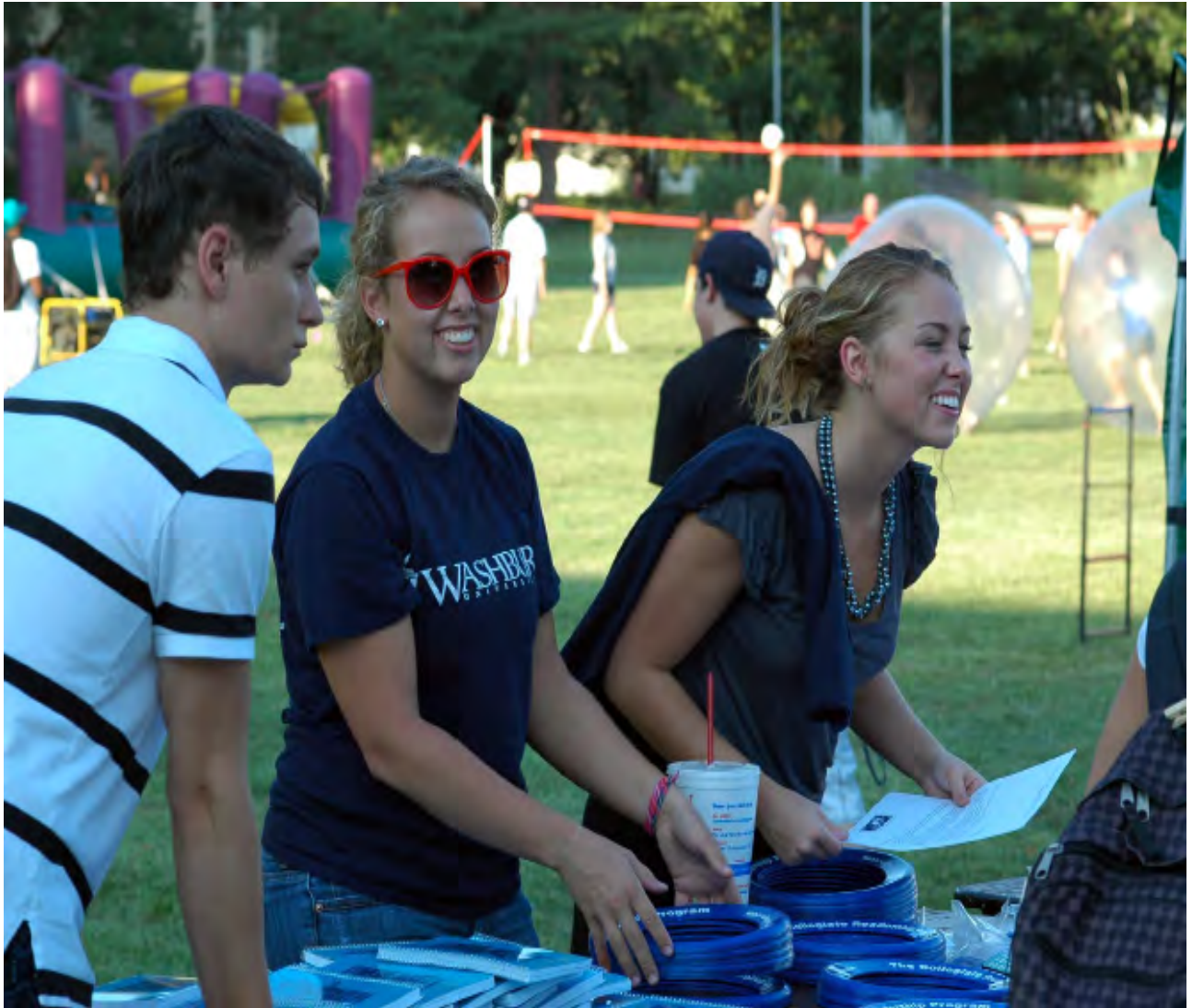
Activities and camaraderie add to the fun at WUFest which is part of Welcome Week.