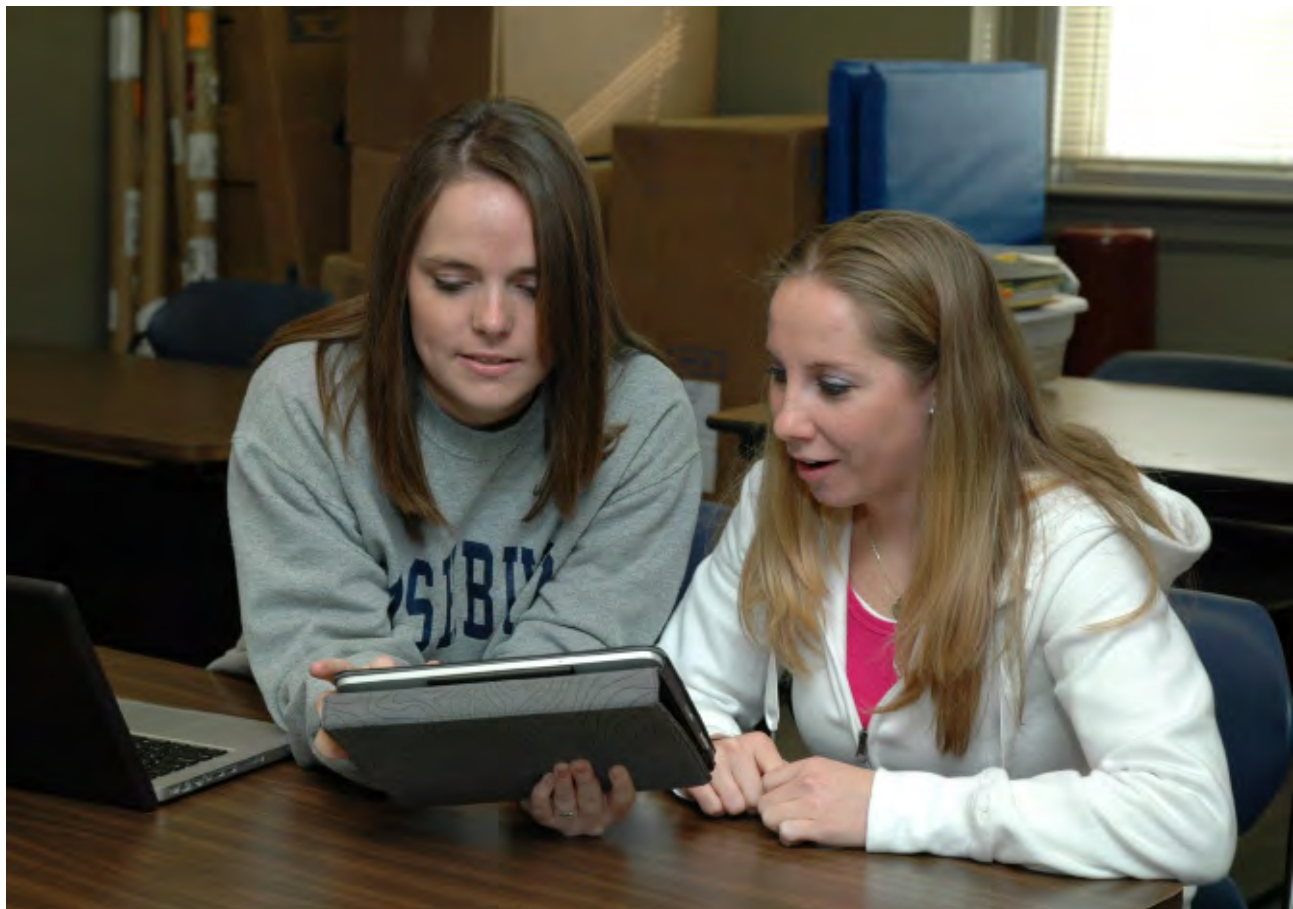
Students utilize technology to discuss a class project.

Information is available by contacting the Financial Aid Office in Morgan Hall 267 or by calling 785-670-1151 or (800) 524-8447. Admission to Washburn University is a prerequisite for consideration of financial assistance.