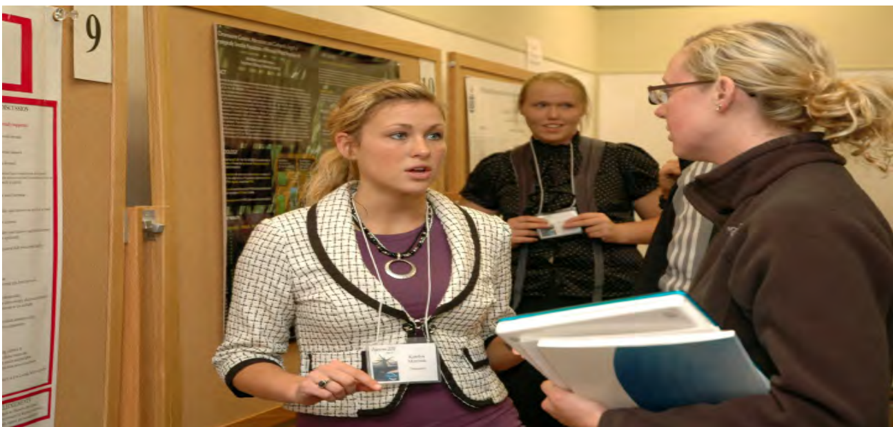
A student discusses her Washburn Transformational Experience with another student at the Day of Transformation.

The Master of Social Work is administered by the Department of Social Work. For complete information about the MSW program, see Graduate Programs in the index.