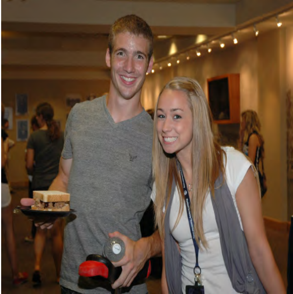
Students enjoying the activities at Convocation 2011.