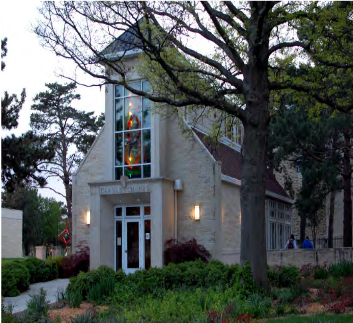
The Carole Chapel sits in the center of the campus.