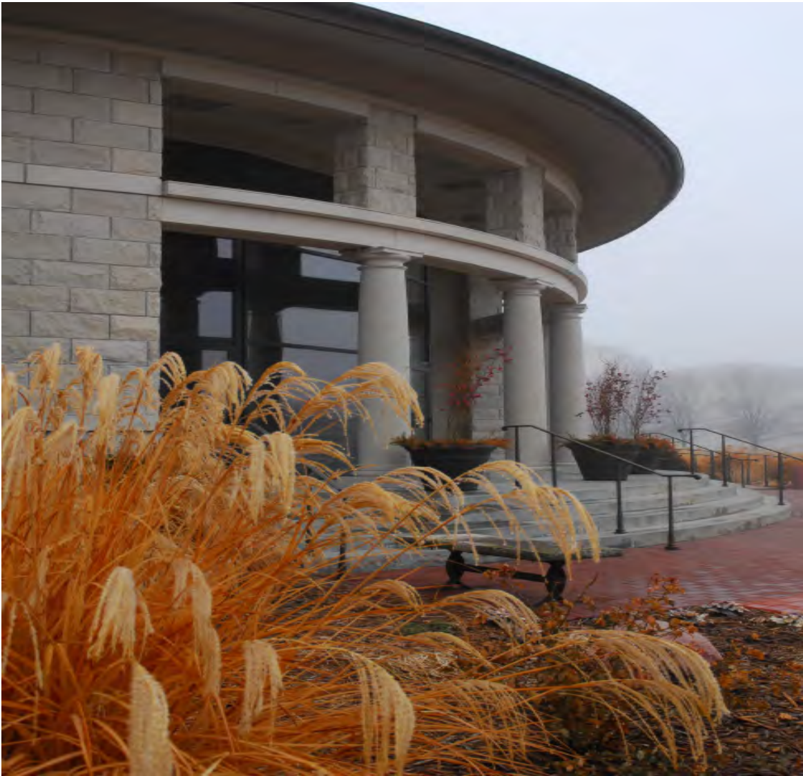
Bradbury Thompson Alumni Center