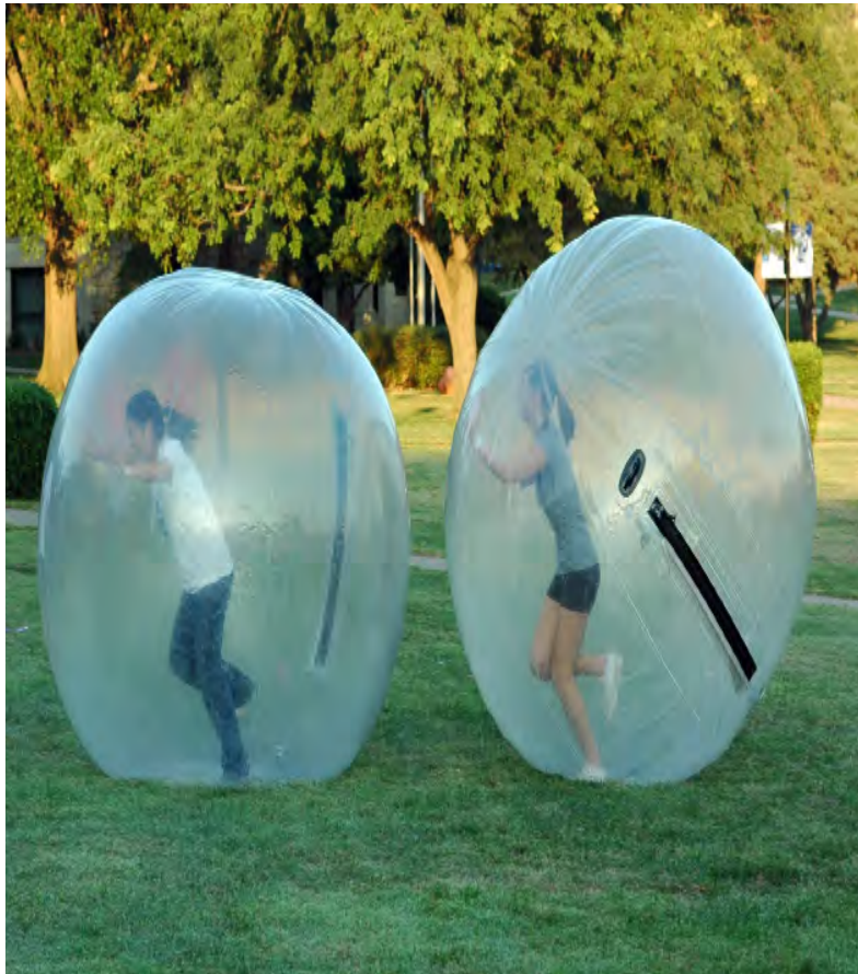
Students enjoying activities during Welcome Week.