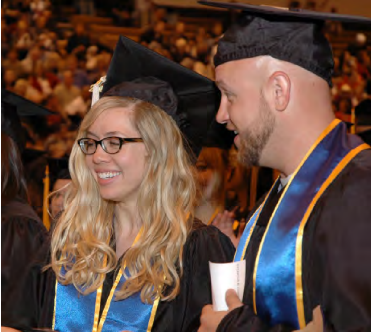
New graduates celebrate their accomplishments during commencement.