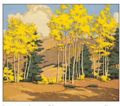
"Aspen and Spruce" by Norma Bassett Hall, 1949, serigraph

The Prairie Print Makers and the varied activities of their members played an important role