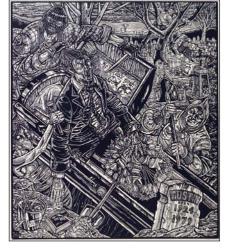
"Two Weeks in August, Exhuming Moses," by Tom Huck, 1999, woodcut

In aquatint, areas of gray are created by adhering acid resistant, powdered rosin onto a plate. When the plate is placed in the acid bath, the spaces between the grains of rosin powder are etched. To create various shades of gray, the artist first coats areas to remain white with an acid resistant material; this is called stopping out. Then the plate is placed in the bath repeatedly with the artist progressively stopping out areas that are to be lighter shades of gray. The longer an area is not stopped out, the