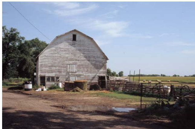
above: Dairy barn on Edwin Pahls farm.

According to Ed "there were probably three ears in the air all of the time. You ought to have seen those guys pick corn." And working quietly among the frenzy of the corn pickers