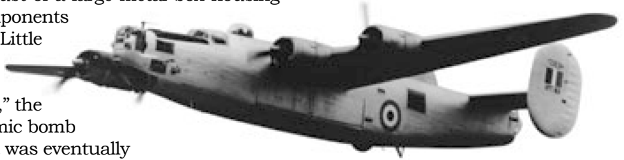
above: Consolidated B24L-20-FO Liberator. Visit the Royal Air Force Museum: www.rafmuseum.org.uk