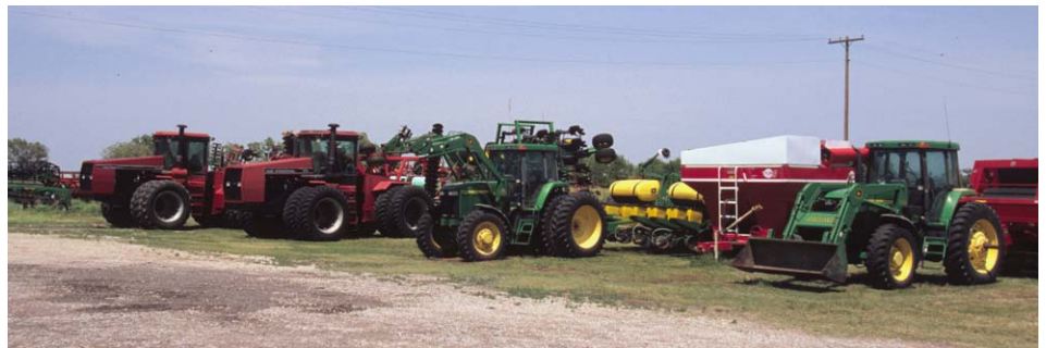
above: Pahls' family tractors ready for work.

T he old homestead displayed the usual assortment of buildings found on Kansas farms in the 1920s: a Dutch barn with lean-tos, a chicken coop surrounded by mesh