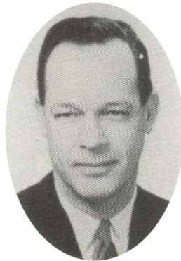
left: Governor John Anderson, now and then.

Anderson also talked about current campaigns and their high expenses, noting that in 1960 when he ran for Governor he spent a total of $60,000 on his campaign. Anderson's visit is part of a continuing lecture series by the political science department that has brought former governors William Avery, Mike Hayden, and John Anderson, and current governor Kathleen Sebelius to campus.