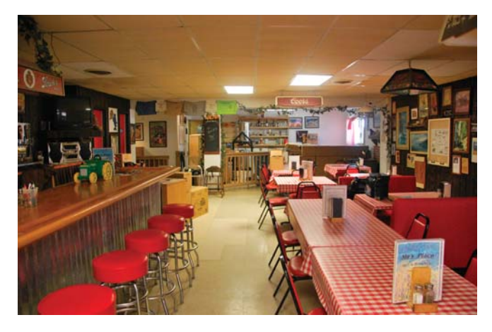
Interior of Mo's Place with brewing area below the Coors sign. Len does sell a limited variety of domestic beers, but most of the beer he sells he makes.