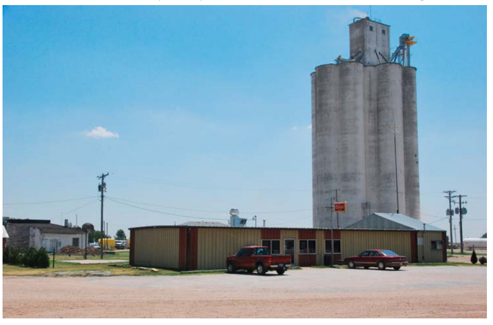
Mo's Place on Elm Street in Beaver. The grain elevator in the background is the only other business in town.

the beginning. Three days after opening, because of a gas leak and fire, they had to replace an old stove with a new one costing $5,000.