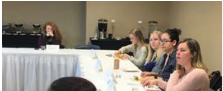
Some Advisory Board members enjoy lunch and discussion with the Dean. Topics included communication methods, Washburn’s website, and general feedback.