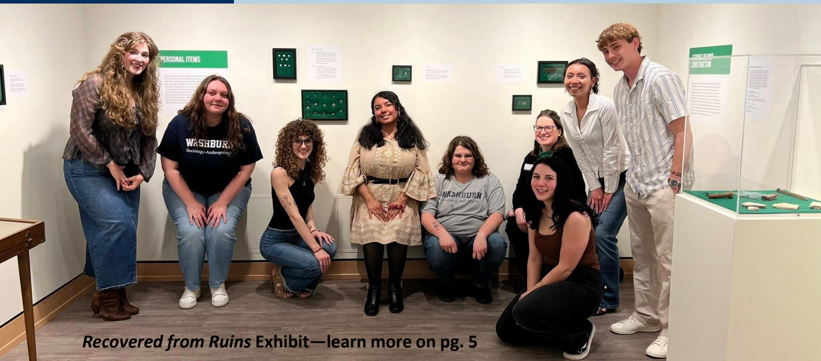
Recovered from Ruins Exhibit—learn more on pg. 5