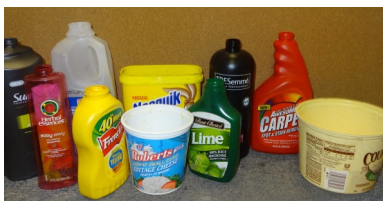
Plastic Bottles & Tubs ONLY Plastic #1 & #2