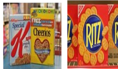
Cereal Type Boxes