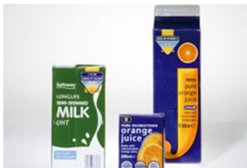
Wax Coated Milk Cartons and Juice Boxes

STOP, these items cannot be placed in your bin: