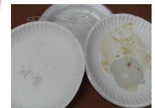
No Paper Plates

Visit WUSustainability Network on Facebook, email Sustainability@Washburn.edu or call 785 760-1132.