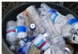
Plastic Water Bottles