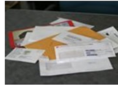
Junk Mail and Phone Books