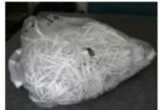
Place Shredded in Clear Plastic Bags