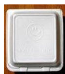
No Styrofoam of any Kind