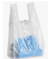
Plastic Grocery Bags