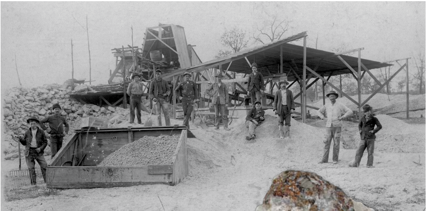
Above, Daisy D Mine, Cherokee County, circa 1890; right, mineral sample from local mines.

Workers from dozens of European countries were drawn to the lush landscapes of southeast Kansas in the late 19th century. Naturally occurring minerals buried just underground drew these men and their families from places like Italy, Austria, Germany, Yugoslavia, England, Wales, Scotland, France, and Belgium. They put their skills to work in the coal and zinc mines; they shared their traditions with the region, which became known as the “Little Balkans.”