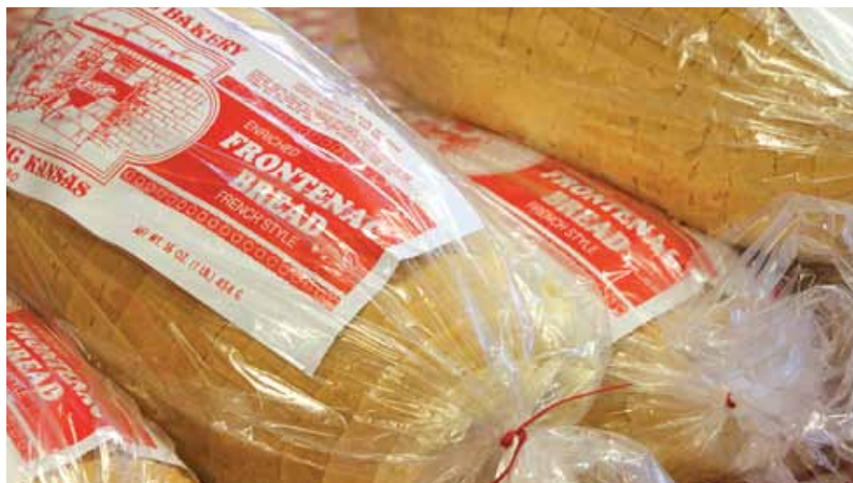
Loaves of fresh bread from the Frontenac bakery.

People from Italy were among those to join the mining workforce in the area, which boasts a number of local Italian restaurants. Frontenac Bakery is more than 100 years old. Locals love the delicious baked bread and large cinnamon rolls.