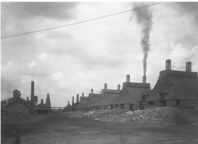
Zinc Smelters, Pittsburg, 1909.

Many stories, photographs, inspection reports, and records of these miners are preserved in the collections of the Kansas Historical Society.