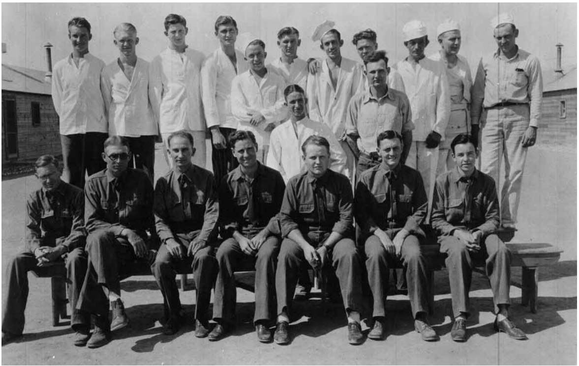
788th Company working in Finney County, 1934.

On June 9, 1935, a group of young men arrived at Farlington in Crawford County to begin a large-scale effort—building a new lake. At first they faced effects of the Dust Bowl; then flooding with constant rain. Many from Kansas, these men were members of the 788th Company of the Civilian Conservation Corps (CCC).