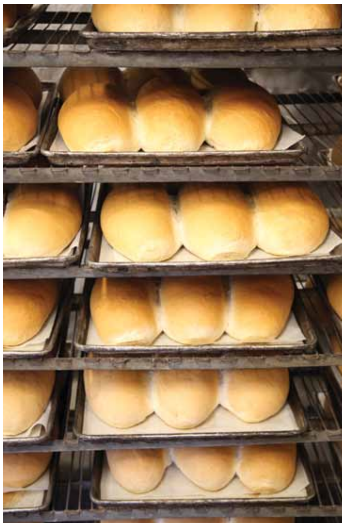
Bread baking in the bakery's historic brick oven.