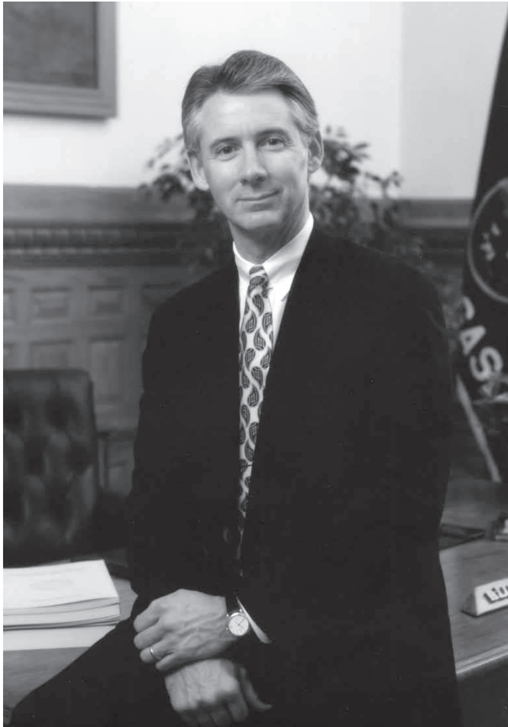
Governor William Preston Graves in the governor's office in the 1990s.